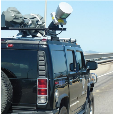
HDL-64E mounted atop mapping collection vehicle. 360° sensor rotates up to 15 Hz.

The HDL-64E S2 provides high definition 3 dimensional information about the surrounding environment.